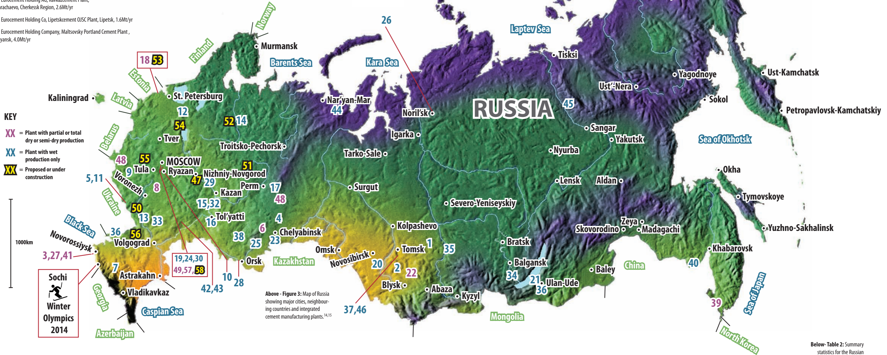
Above - Figure 3: Map of Russia showing major cities, neighbouring countries and integrated cement manufacturing plants. 14,15